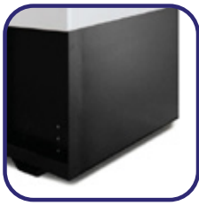
24 hour tank

Below we detail many of the options from the Industrial range that we make available to you to turn your unit into a unique machine.