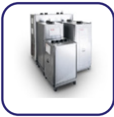
ROTH DUO SYSTEM outside tanks