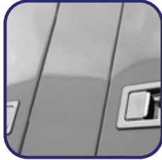
Complete stainless steel canopy (304)