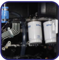
Fuel particle separator filter