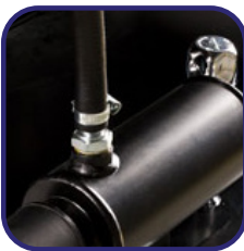
Engine heating system