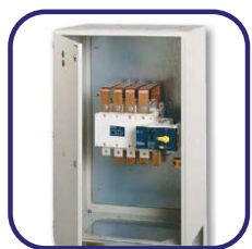
Socomec motorised switchboard