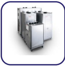
ROTH DUO SYSTEM outside tanks