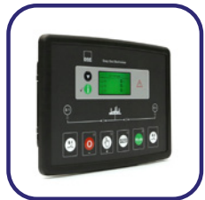
DSE 334 network surveillance