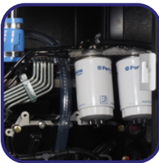
Fuel particle separator filter