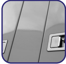
Complete stainless steel canopy (304)