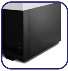
24 hour tank

Below we detail many of the options from the Industrial range that we make available to you to turn your unit into a unique machine.