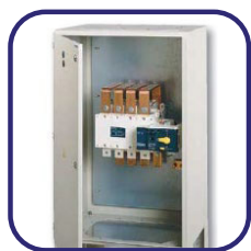
Socomec motorised switchboard