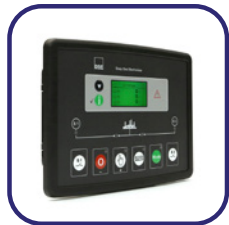
DSE 334 network surveillance