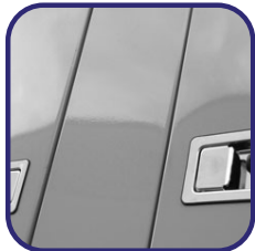
Complete stainless steel canopy (304)