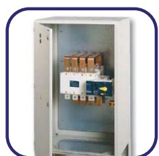
Socomec motorised switchboard