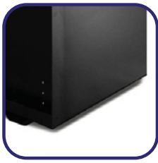
24 hour tank

Below we detail many of the options from the Industrial range that we make available to you to turn your unit into a unique machine.