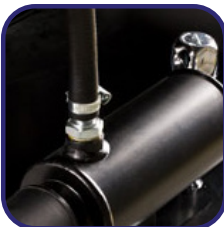
Engine heating system