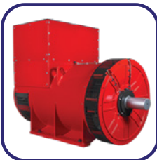
Stamford alternator supplement