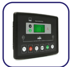
DSE 334 network surveillance