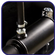
Engine heating system