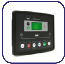
DSE 334 network surveillance