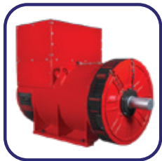
Stamford alternator supplement