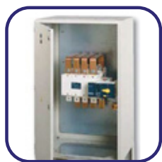
Socomec motorised switchboard