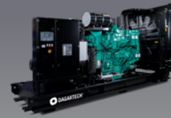
DGC 860 ST