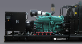
DGC 1230 ST -

• Recommended use for Standby applications. Indicative PRP Power Data.