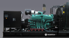
DGC 1000 ST