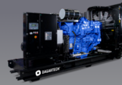
DGB 1400 ST