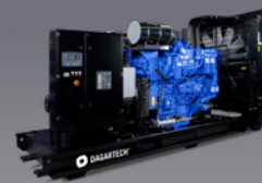
DGB 1250 ME