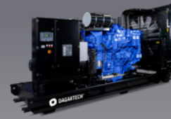
DGB 1000 ST