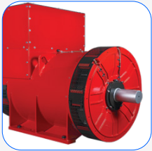
STAMFORD extra price