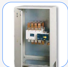
Socomec motorised switchboard