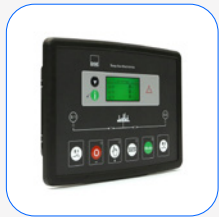
DSE 334 network surveillance