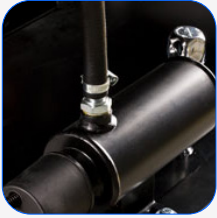
Engine heating system