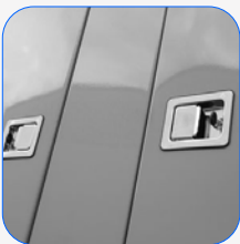
Complete stainless steel canopy (304)