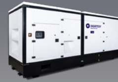
DGCS 1110 ST