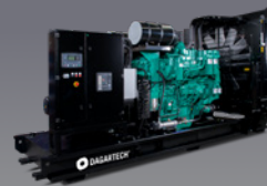
DGC 860 ST