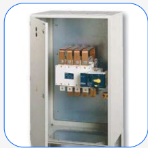
Socomec motorised switchboard