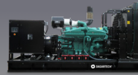
DGC 1230 ST -

• Recommended use for Standby applications. Indicative PRP Power Data.