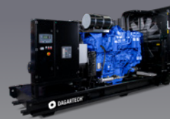
DGB 1110 ST