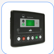
DSE 334 network surveillance